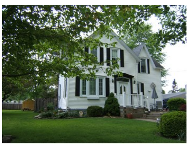
Photographs and Historical Significance courtesy Marney Nichols